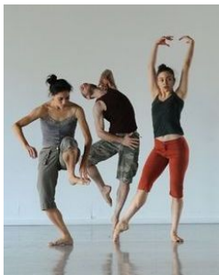
Click photo for trailer

As part of Portland Dance Month , MJFF presents one of the most popular films from our 2018 Festival: Mr Gaga , the story of Ohad Naharin, the renowned choreographer and artistic director of the Batsheva Dance Company.