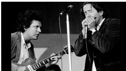
Click on picture to see trailer